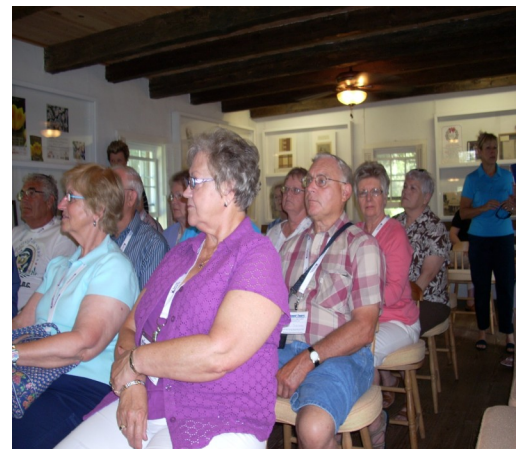
Tour group from Iowa

traffic or selling items. The visitors are fun and interesting and the docents are having a great time getting to know one another better.