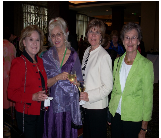
National Garden Club Convention 2010 Atlanta Georgia